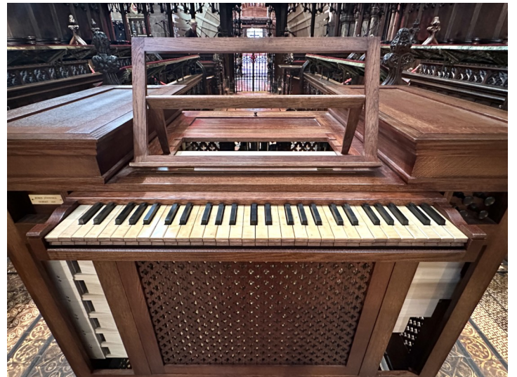
Photo captions from top left: Back of the Main Organ; Chamber Organ in the Quire; Close-up of the Chamber Organ; Pedal Division in the North Transept.