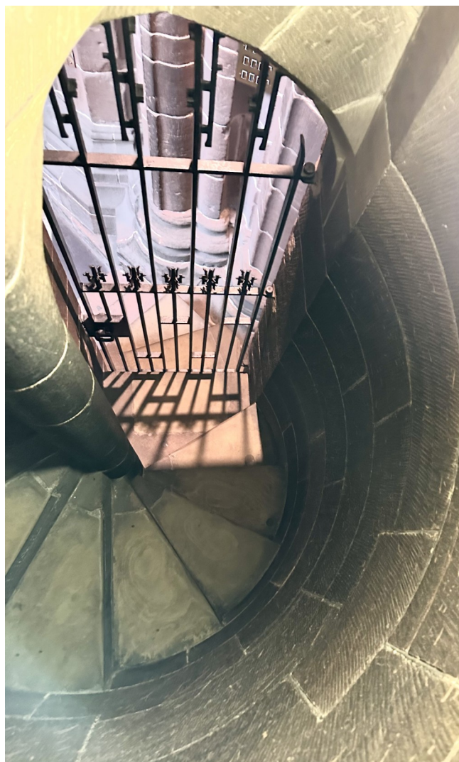
Photo captions, clockwise from above: Lisa in the organ loft; organ loft door and stairs; cathedral organ console. Photo on facing page: Christ Church Cathedral choir and music staff.