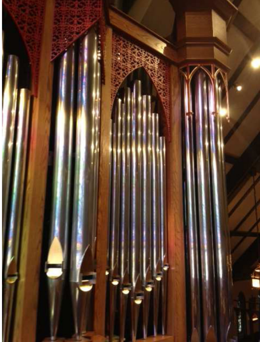
St. Bridget Catholic Church, Richmond, VA, Opus 42