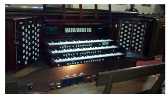
Second Presbyterian, Lexington, KY . New Console