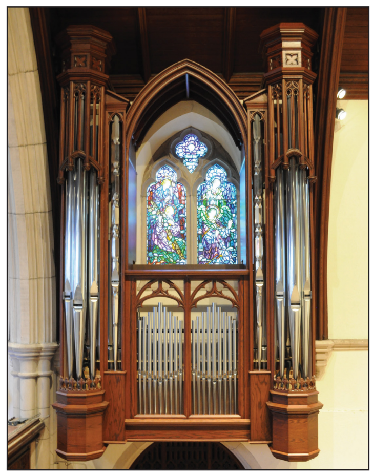
Opus 50 • Good Shepherd Episcopal • Lexington, KY • IV/58

Artistry... Hand-crafted cases, chests, and consoles built in our shop from the best materials by expert craftsmen and designers