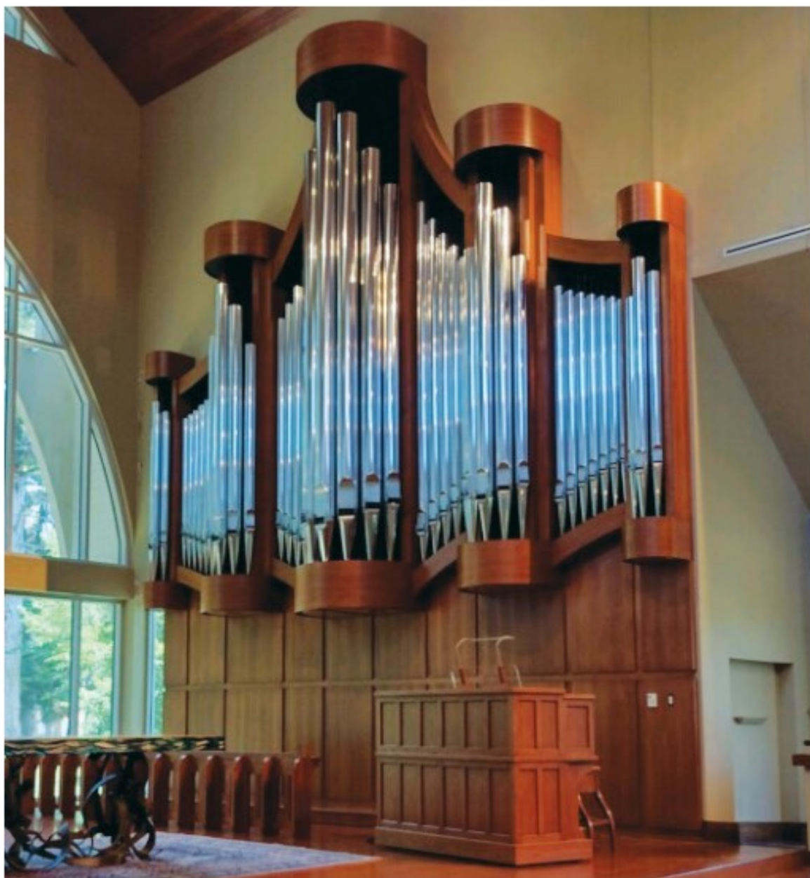
ST. GEORGE'S EPISCOPAL CHURCH - GERMANTOWN, TENNESSEE Opus 46 - Three Manuals - Fifty-eight ranks

823 Massachusetts Avenue • Indianapolis, Indiana 46204 (317) 637-5222 • www.gouldingandwood.com